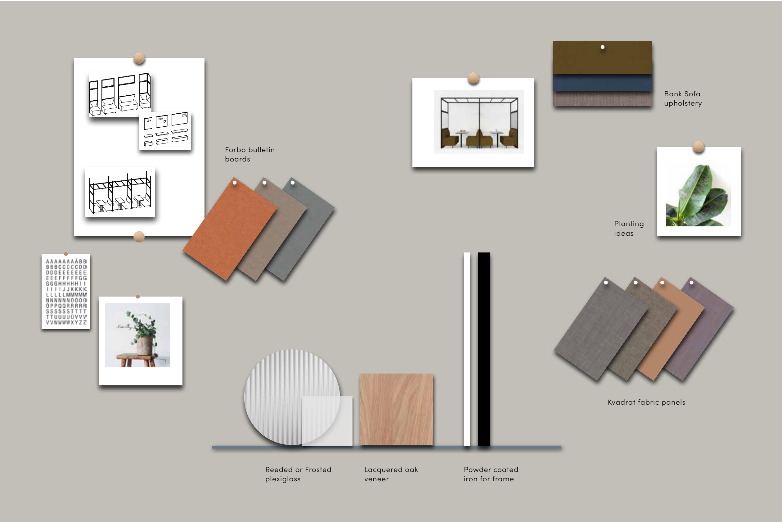
Forbo bulletin boards

In addition to metal, lacquered oak veneer panels can be incorporated for a softer, airy feel when used for division. The choice of whiteboard, fabric or bulletin surfaces for panels also suit the range of activities an energetic workplace demands.