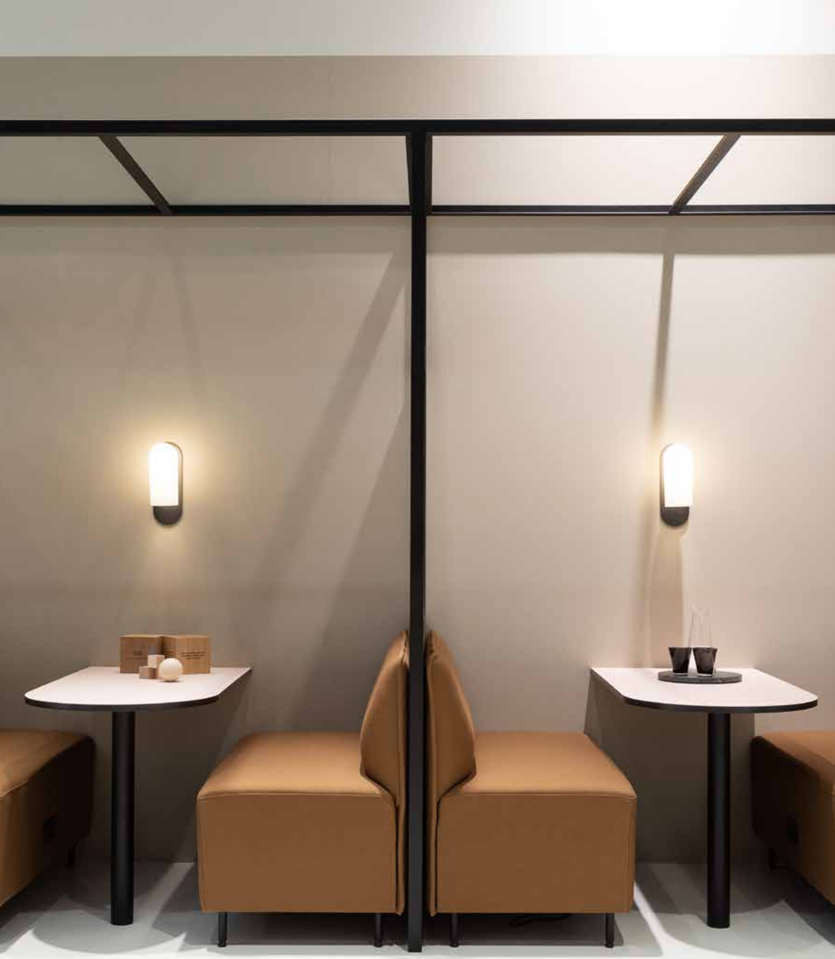
The 4T System and Bank sofa

The 4T system supports the creation of informal meeting zones, integrating seamlessly with Icons of Denmark's Bank sofa