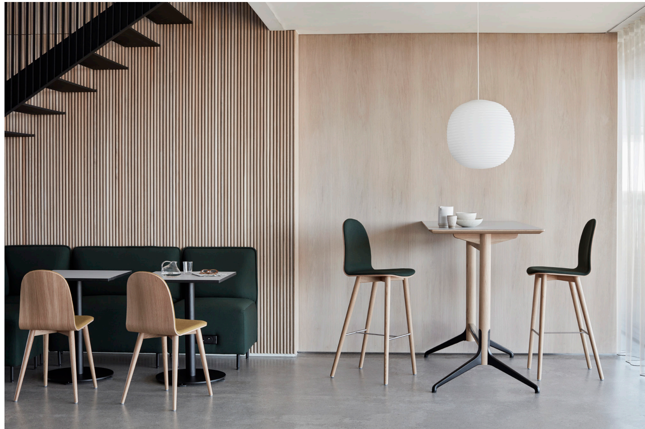
While work is important, furniture can help create places to relax and socialise. Places for casual conversations.