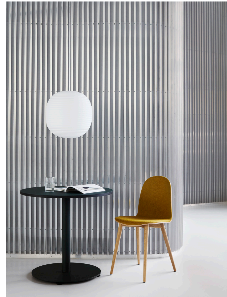
Bank table Nam Nam wood chair

Re-energise and recentre within your work community. Whether a quick coffee and a catch-up or a space to relax into lunch, the cafe setting should appeal to all walks of life with a relaxed and harmonious spirit.