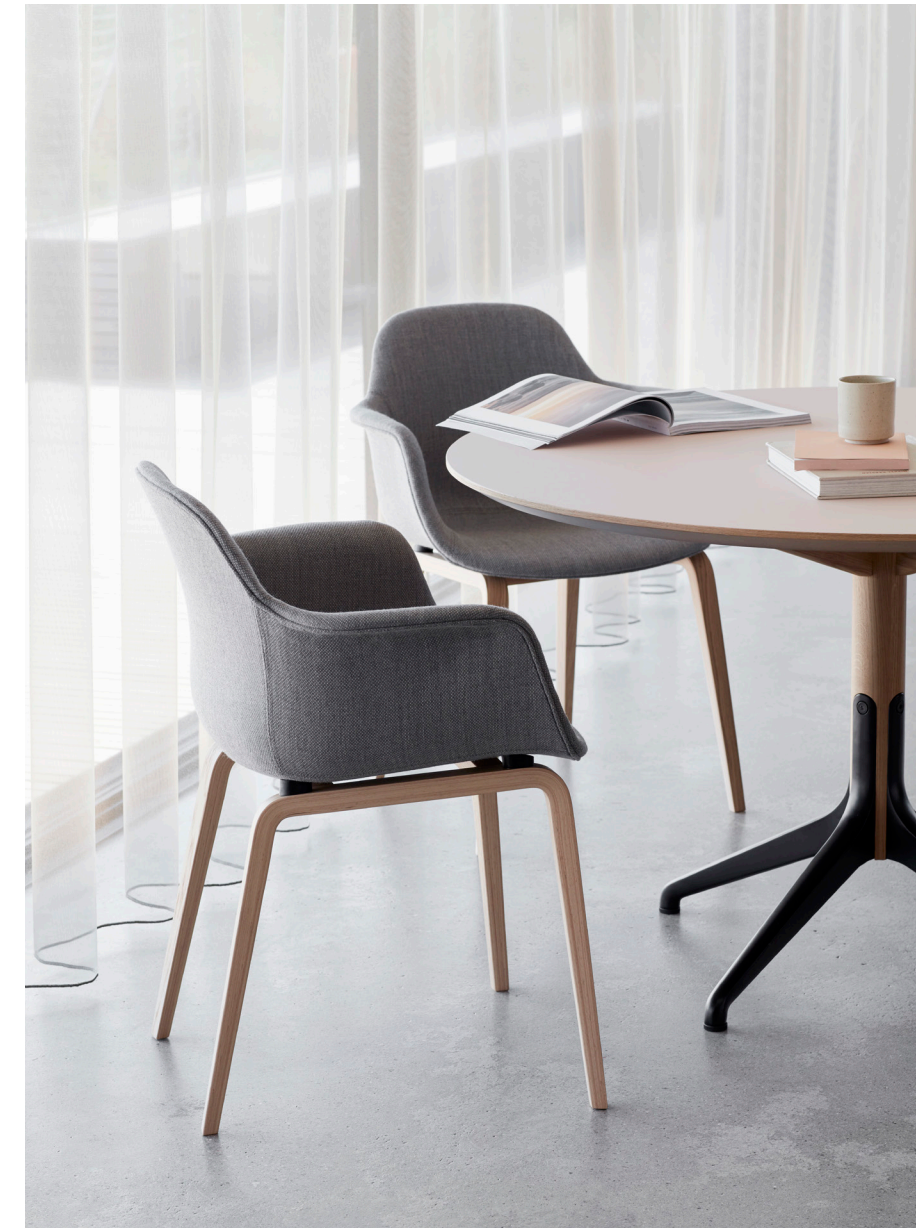
Woodstock round table Arena chair wood base