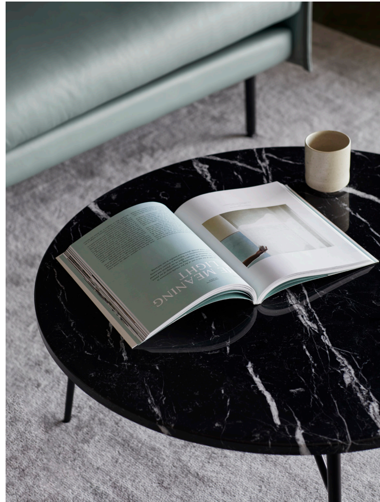
Form sofa Spire marble coffee table