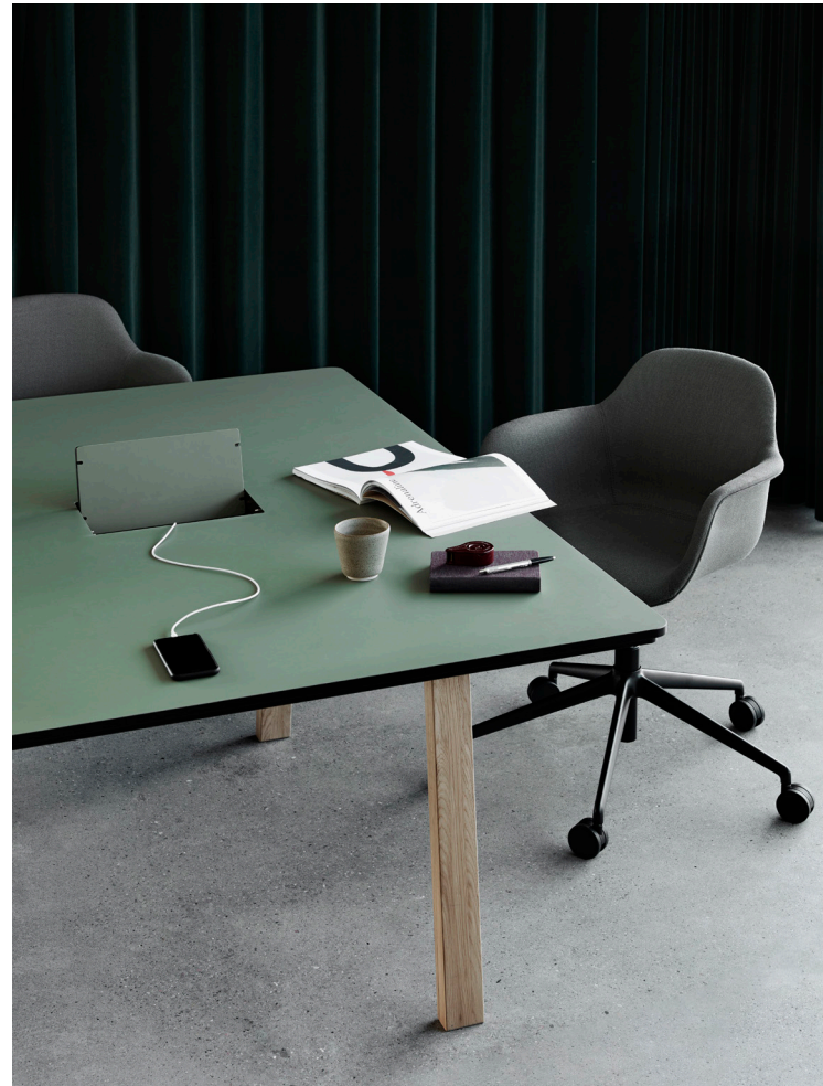
Facit workstation Arena chair gas lift swivel base with castors