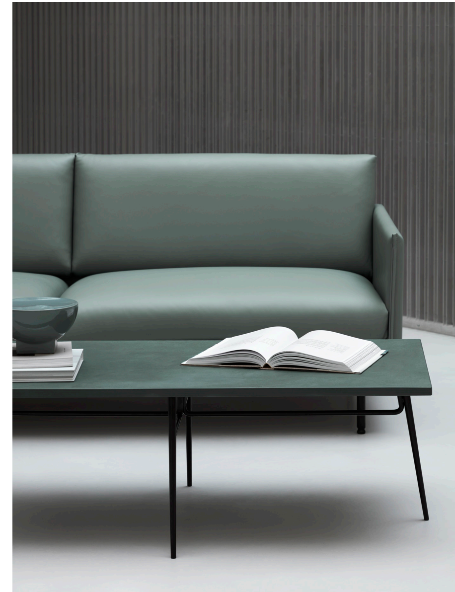
Form sofa Spire slate coffee table

First impressions are always the strongest. On arriving, a new space should invite you into it; providing visual and physical warmth while telling the compelling story of the company.