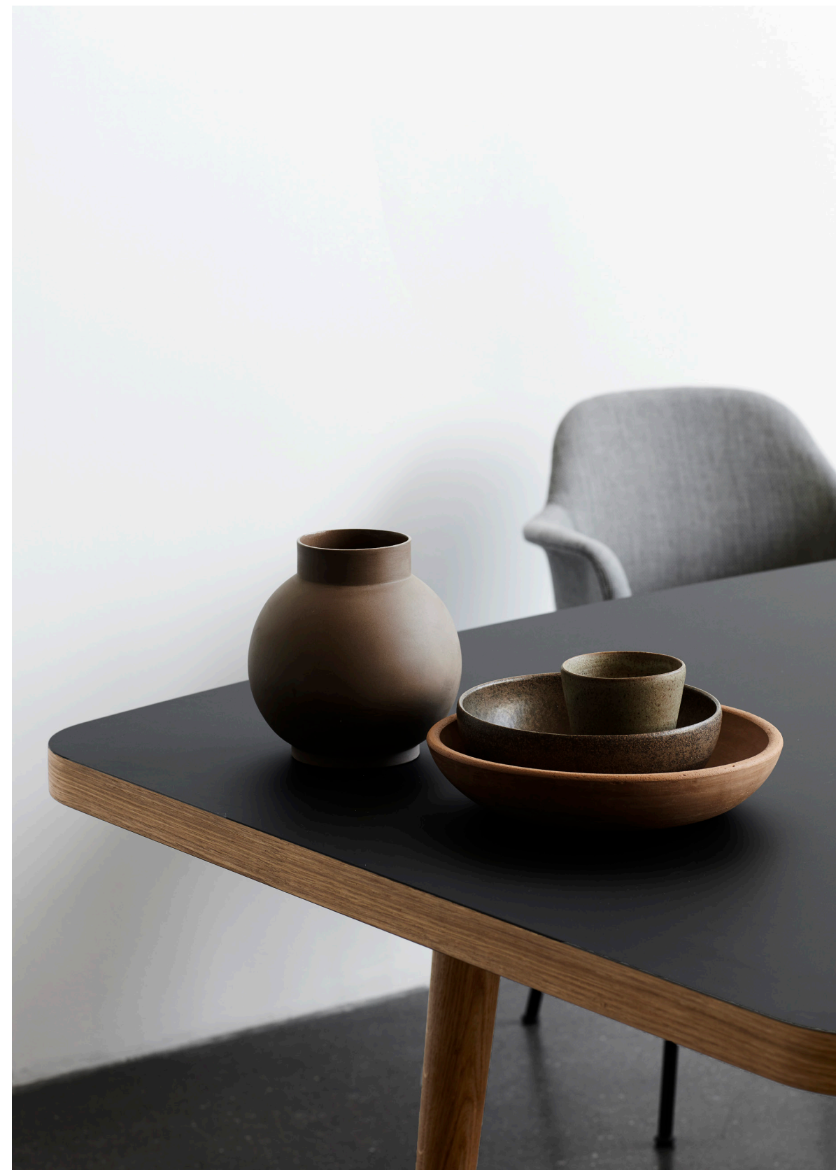
Forum meeting table Arena chair metal base