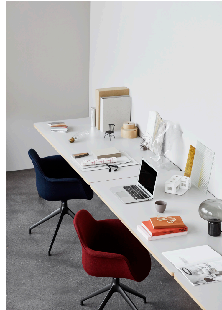
Arena chair swivel base Woodstock flip top table