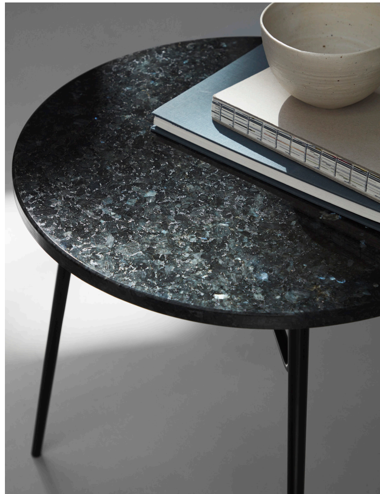
Spire granite coffee table