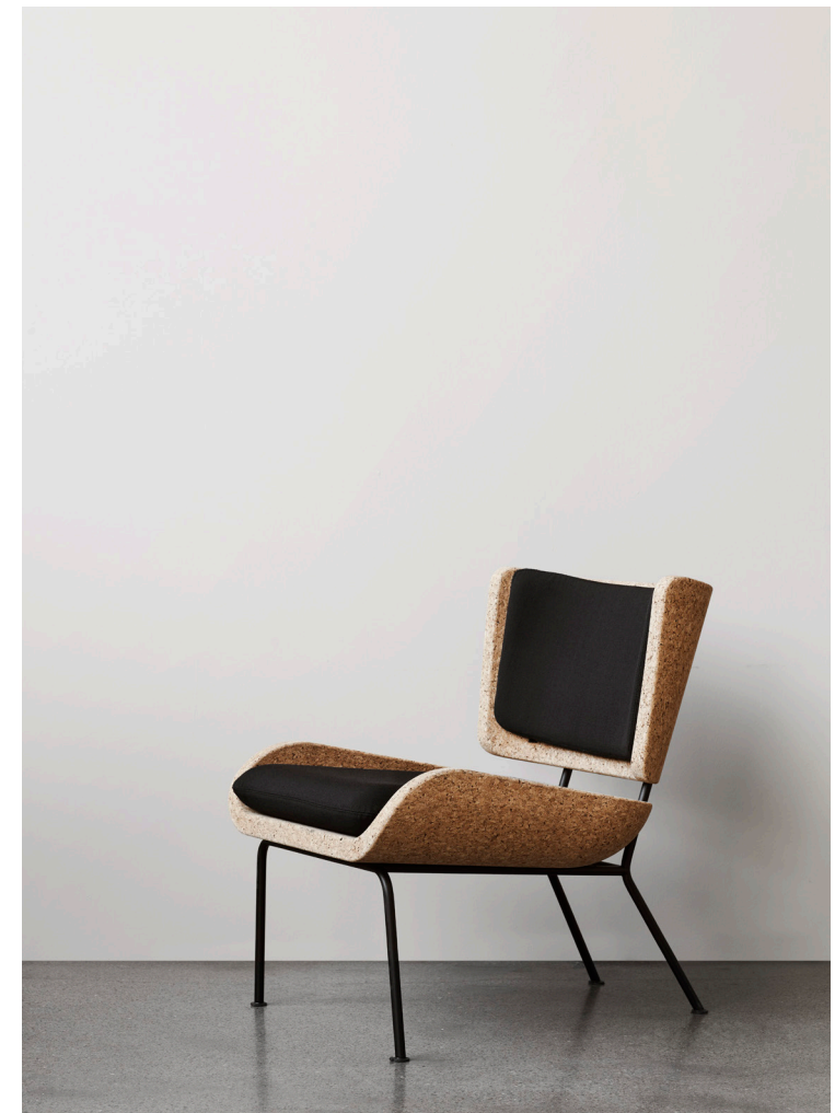
Bark lounge chair