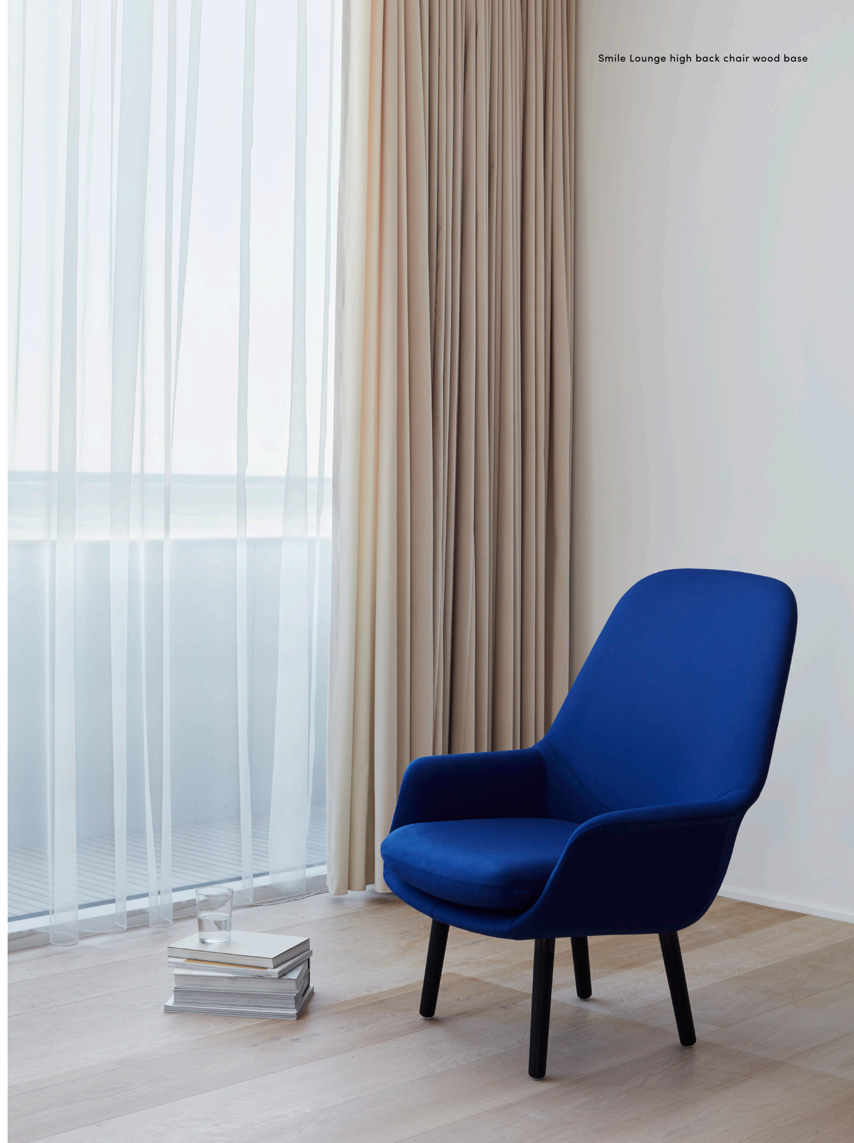
Smile Lounge high back chair wood base