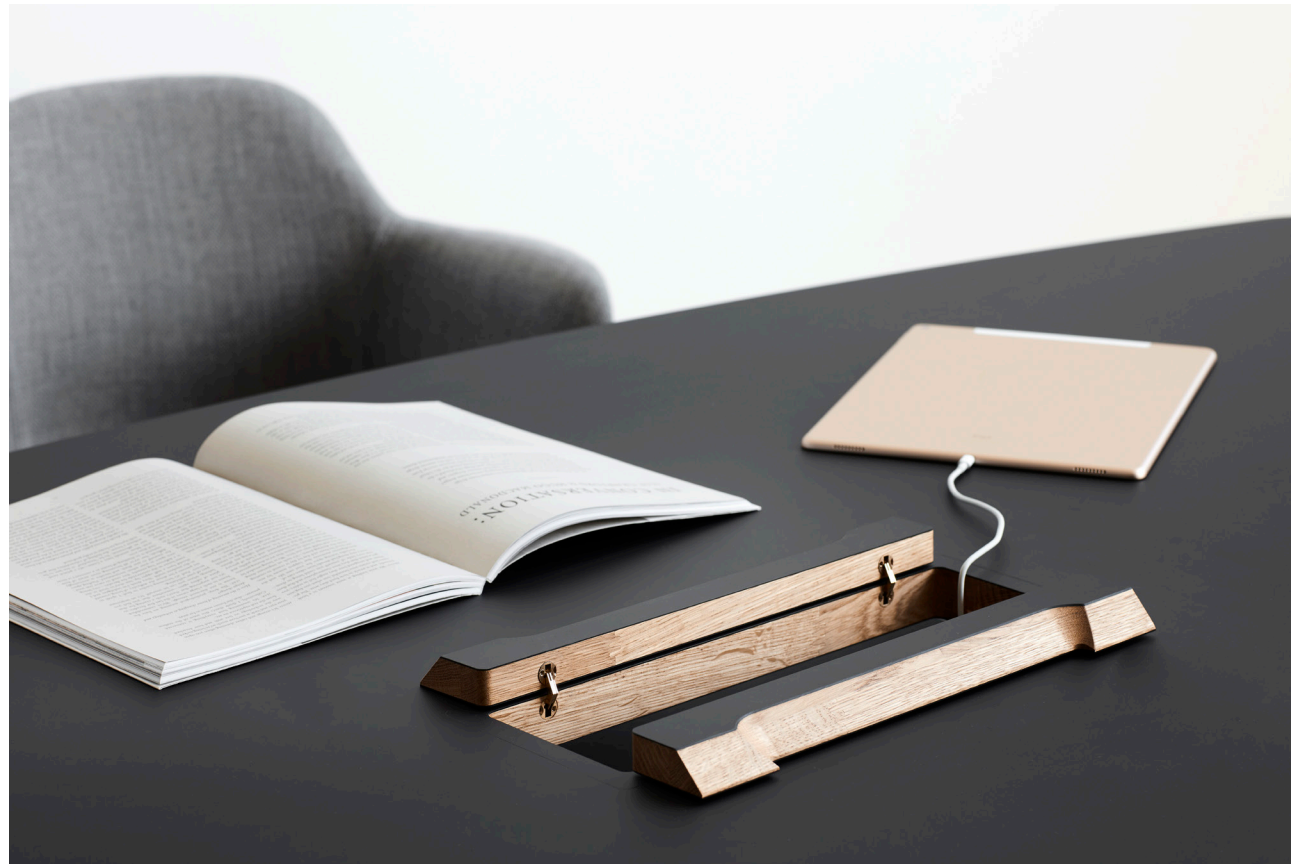
Texture changes perception. Harnessing tactility in surface materials is integral in forming a comfortable environment.