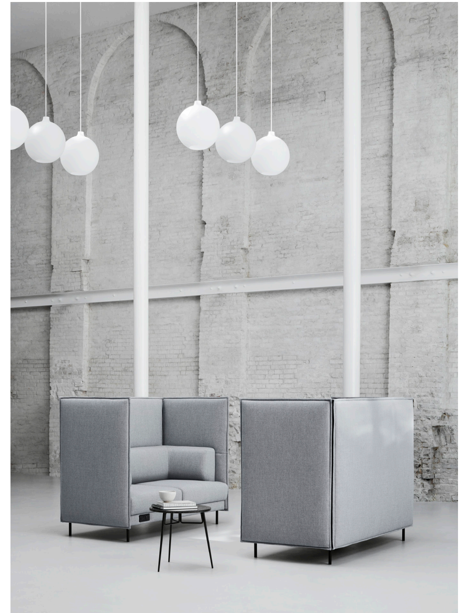
Private high back sofa Spire granite coffee table