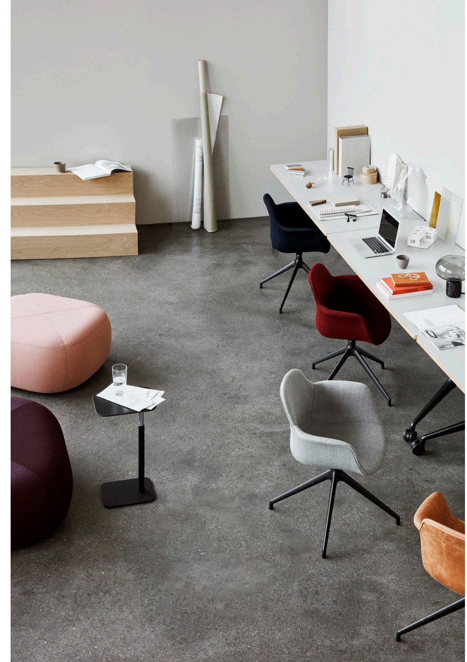
Firkant pouf / Level laptop table / Arena chair swivel base Woodstock flip top table

How best to nurture ideas? An ideal presentation space should be like its host: quietly confident and motivational while creating a substantial, positive impact on the audience.