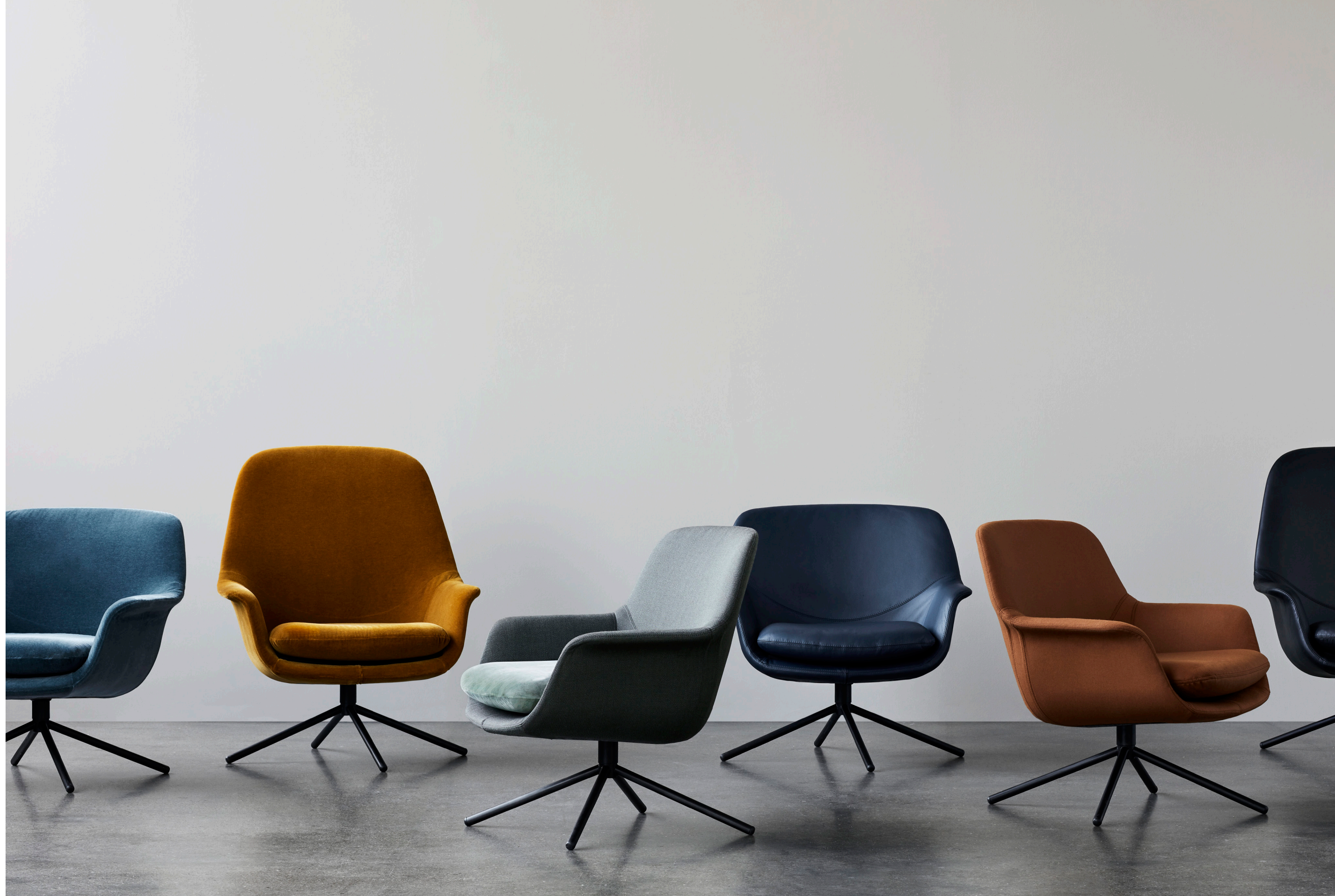
Smile Lounge high and low back chair swivel base