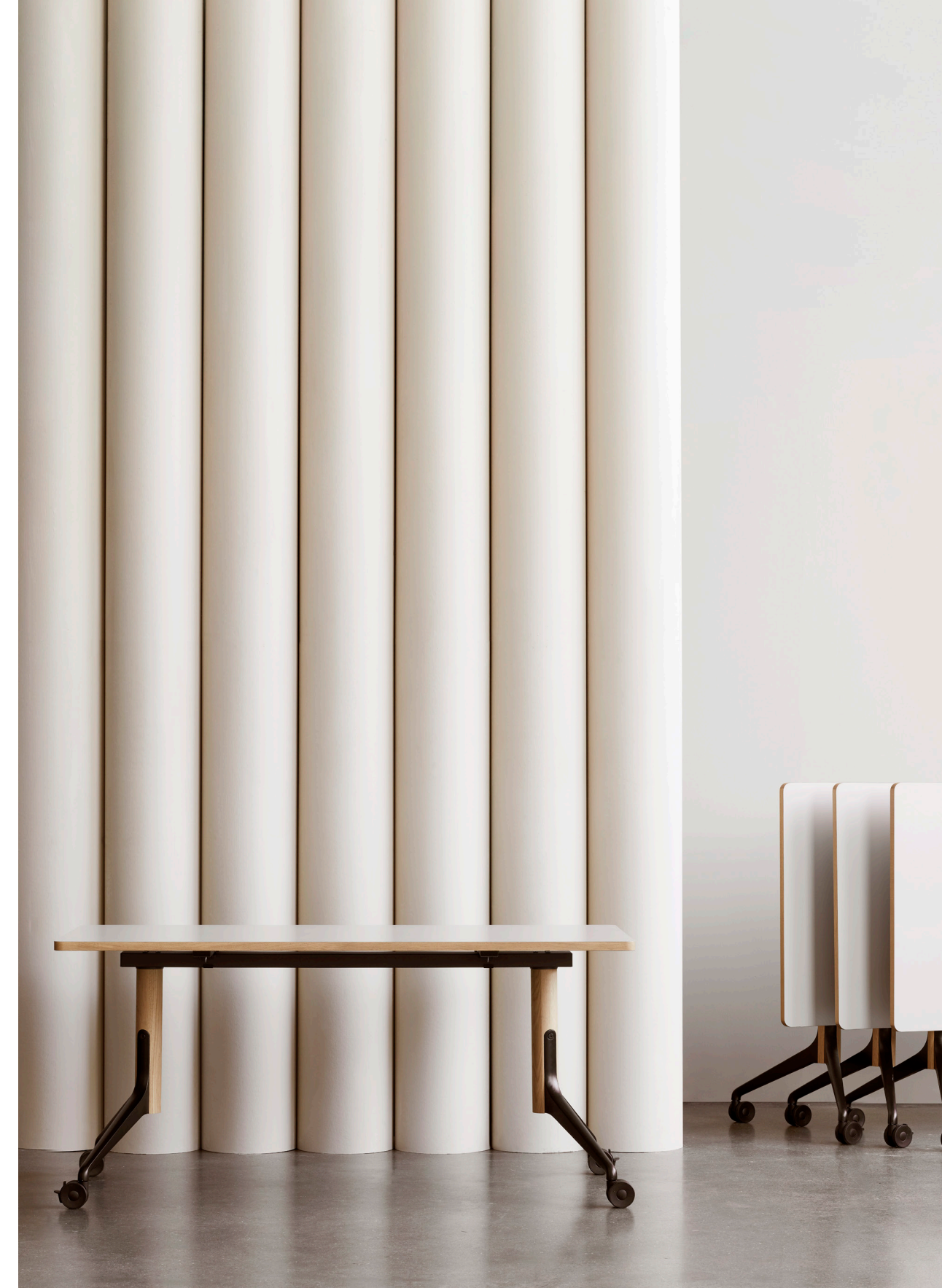
These items are as elegant when stowed as when in use. Movement is designed to be smooth and straightforward, perfect for rapidly changing workplaces.