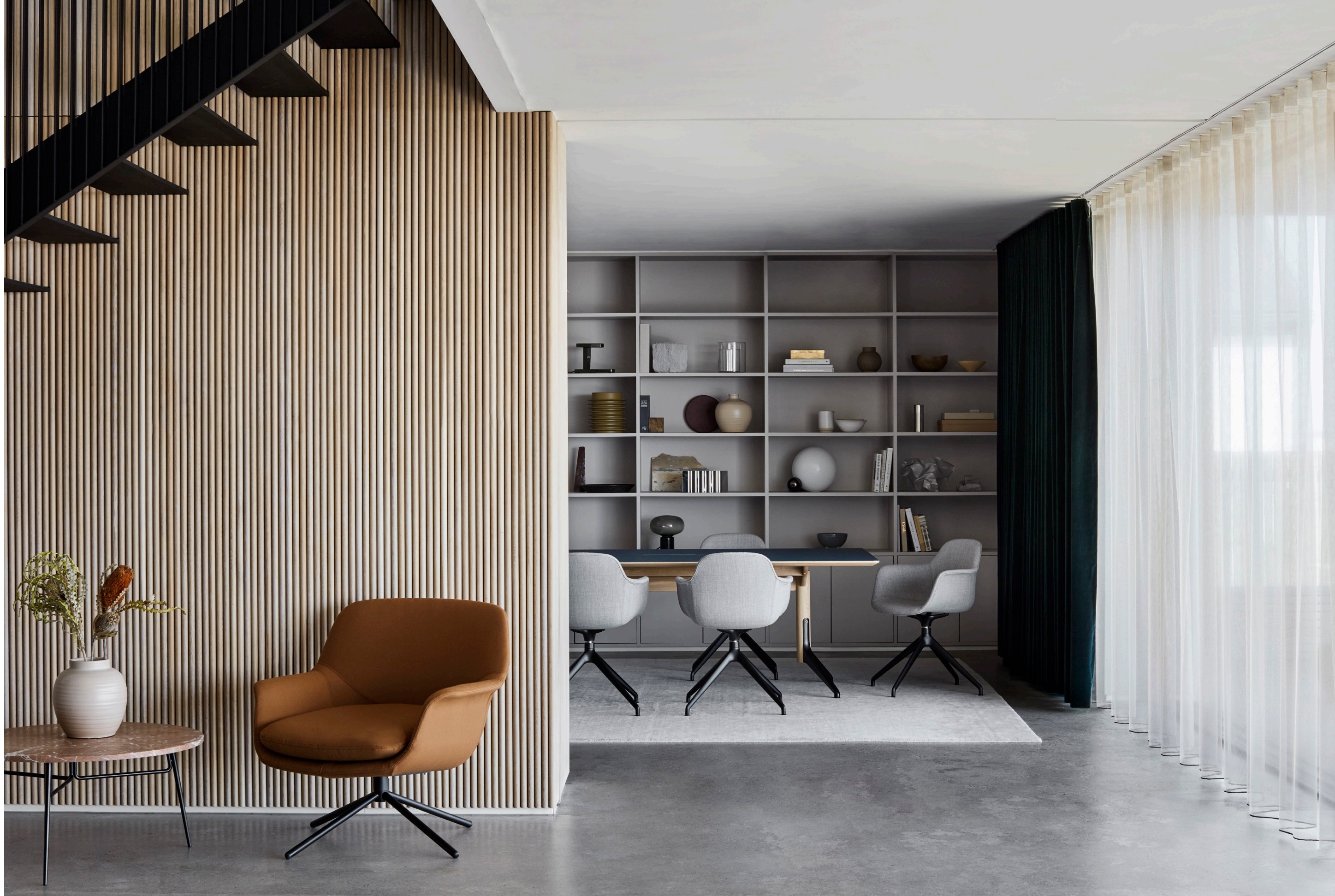
Smile Lounge low back chair swivel base Spire marble coffee table