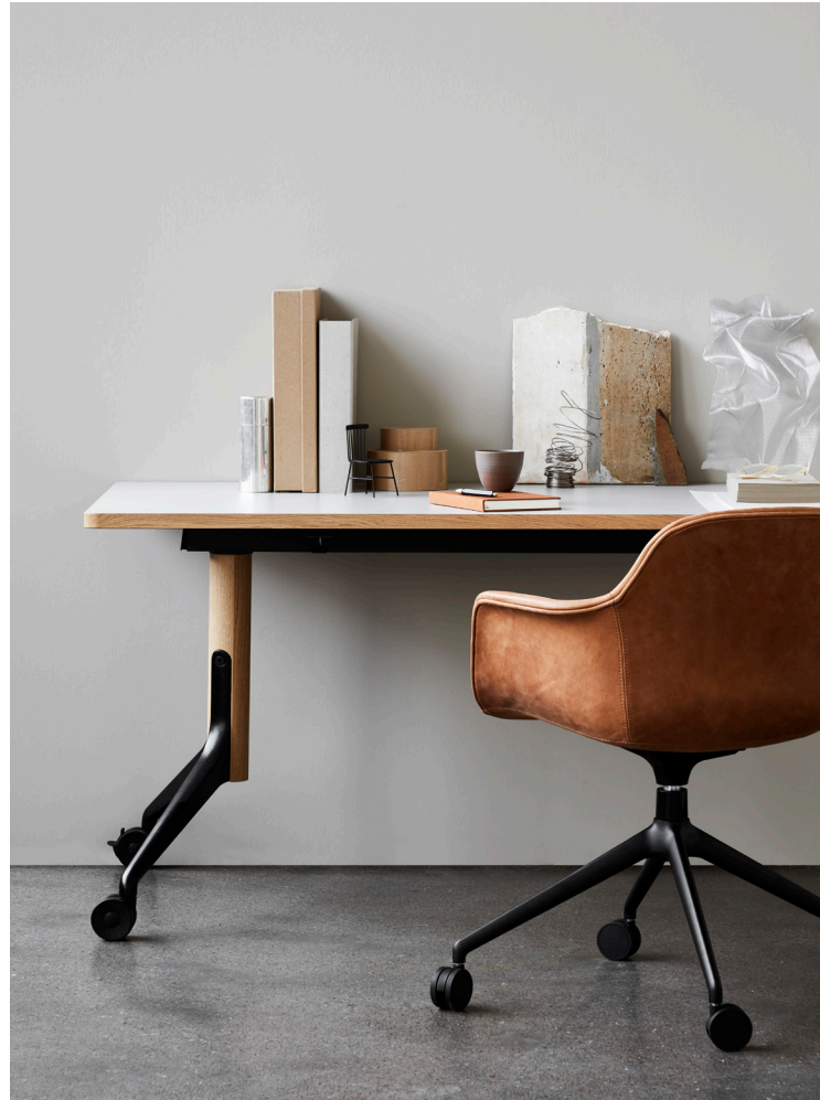
Woodstock flip top table Arena chair swivel base with castors