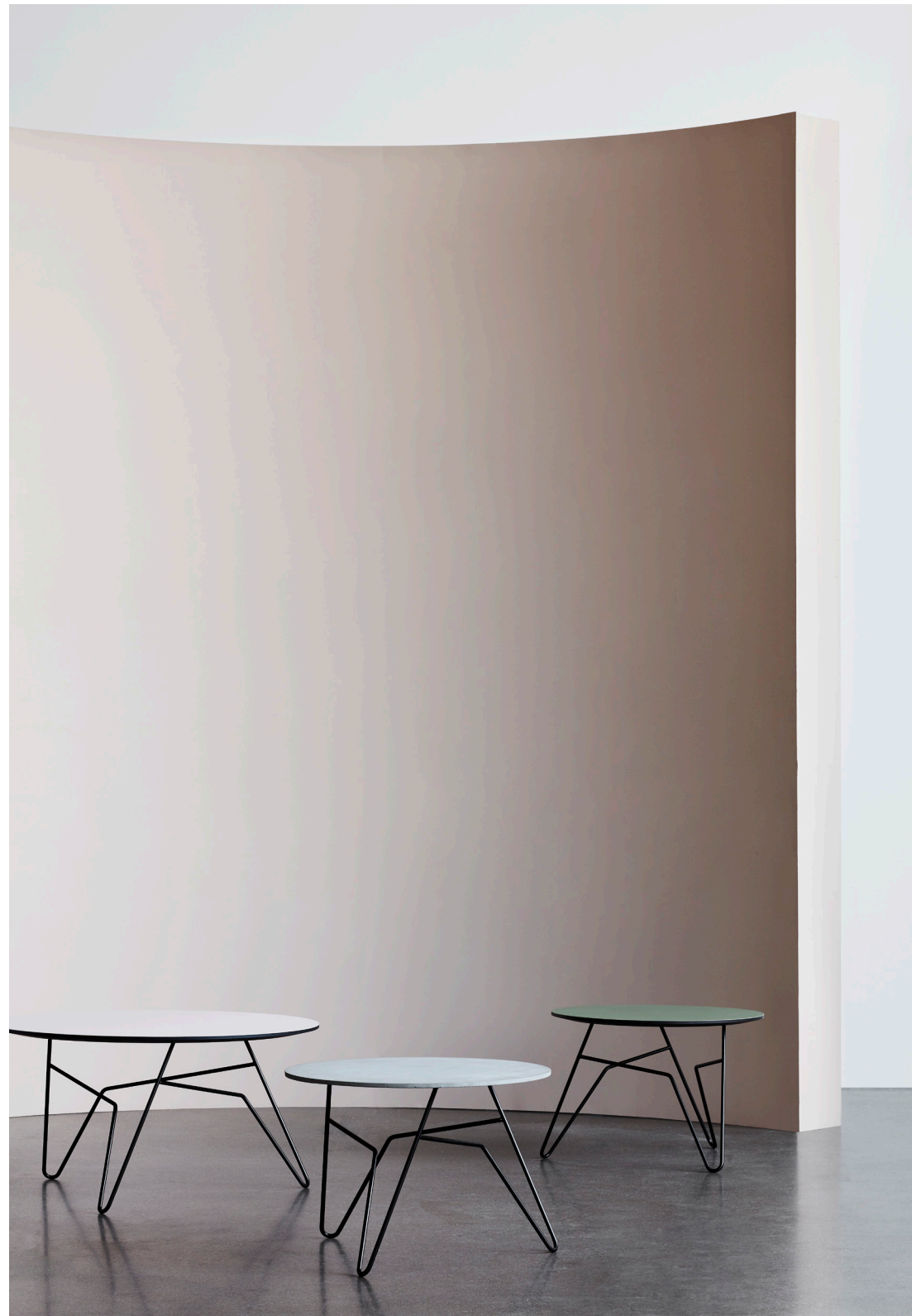
Twist coffee table