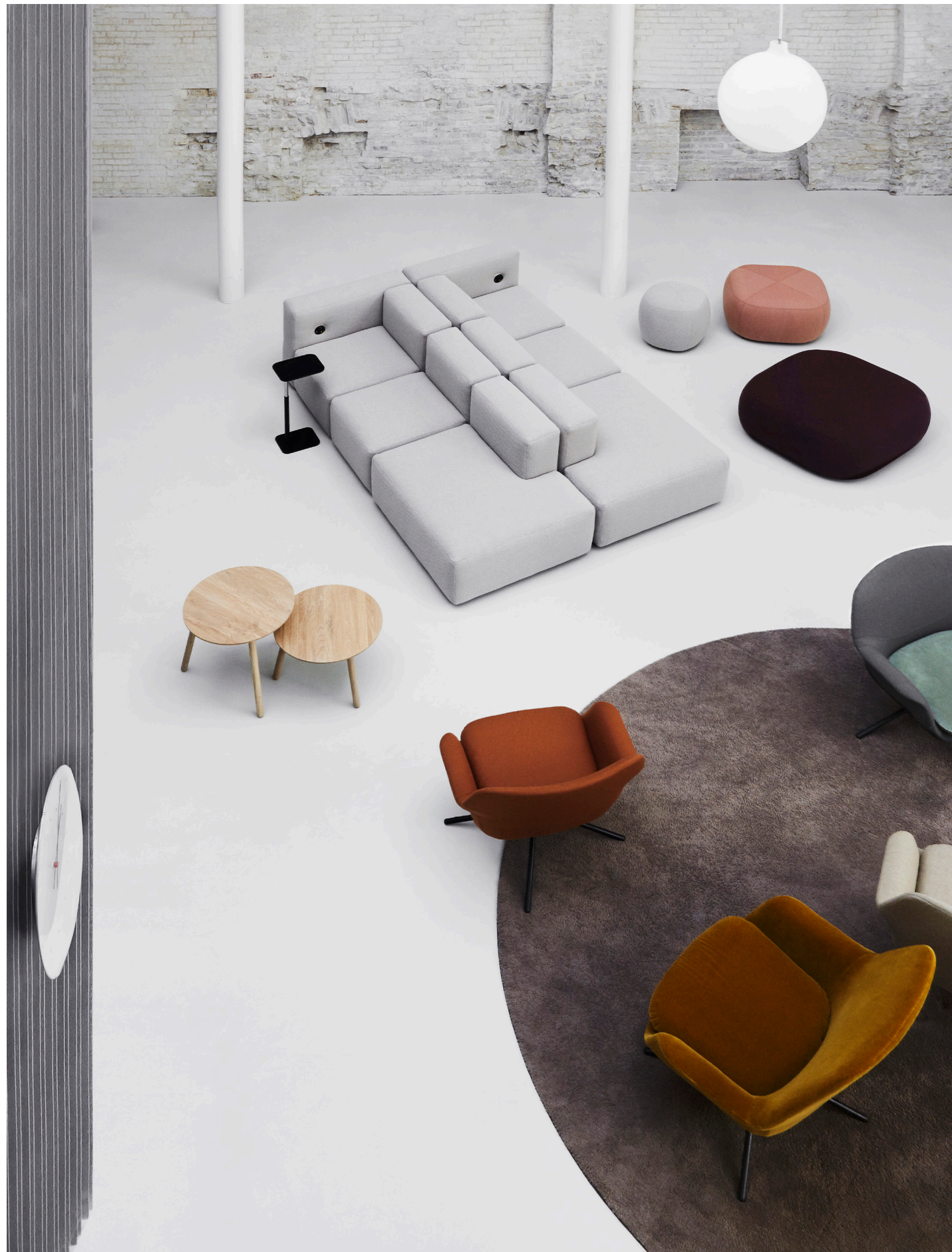
EC1 modular sofa / Level laptop table / Firkant pouf Knock on Wood coffee table / Smile Lounge high and low back chair swivel base