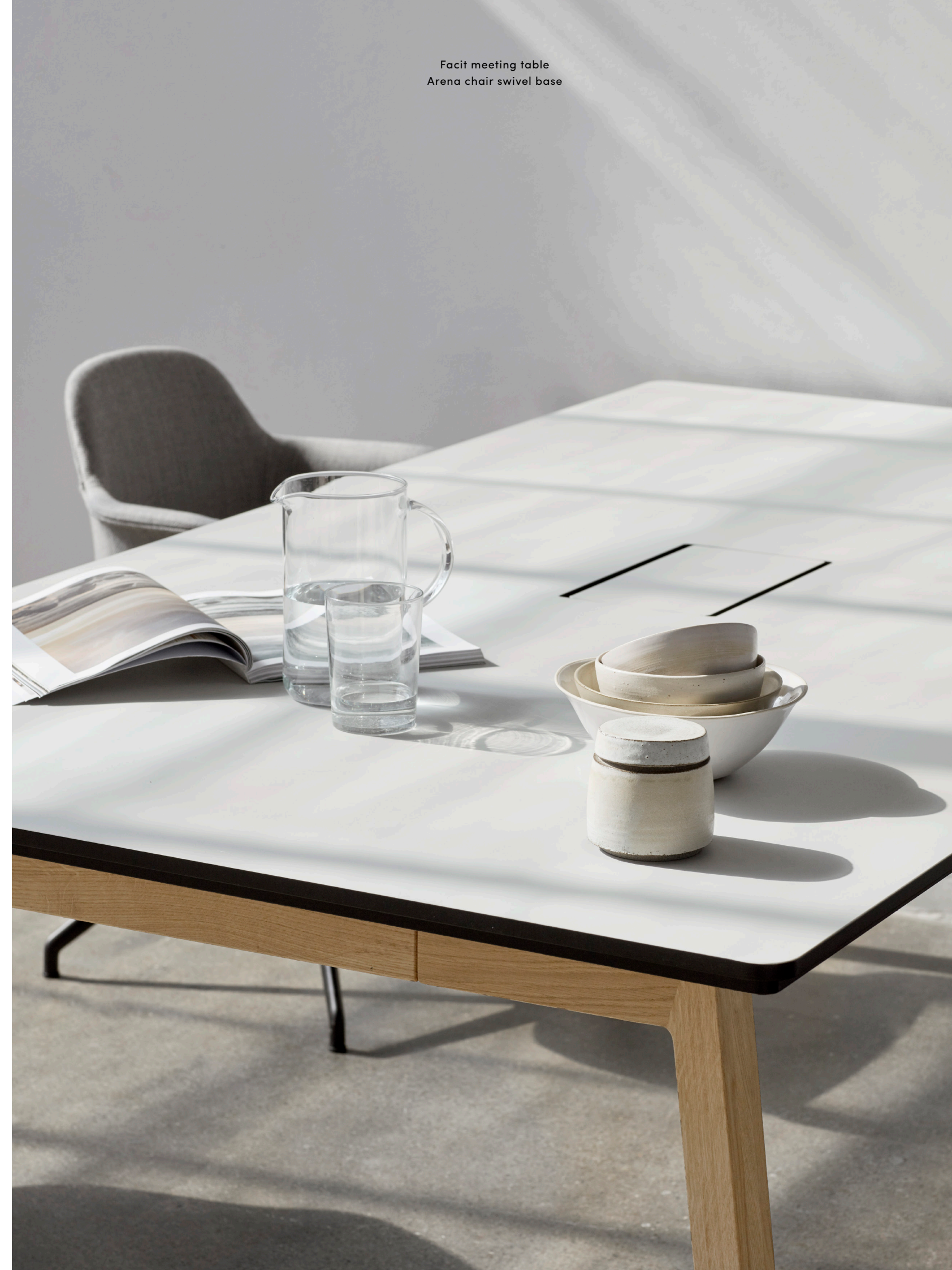
Facit meeting table Arena chair swivel base

From training to executive decisions, the versatility of the conference setting is an essential part of work. Here, personality shines through which is why these settings are often sophisticated and accommodating with adaptability to the needs of the modern world.