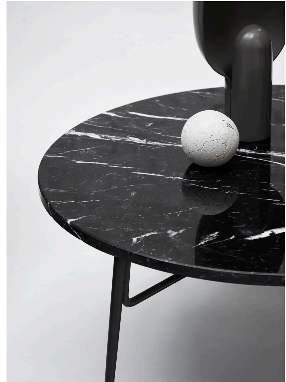
Spire marble coffee table