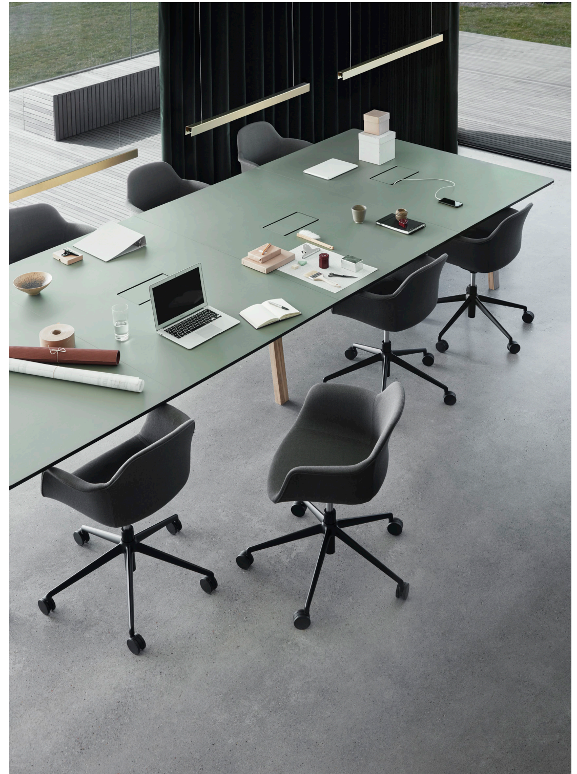
Facit workstation Arena chair gas lift swivel base with castors