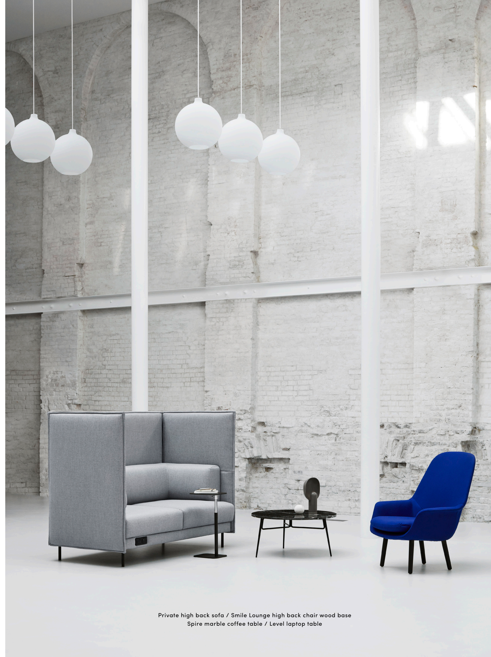
Private high back sofa / Smile Lounge high back chair wood base Spire marble coffee table / Level laptop table

Through the lens of minimalism and simplicity, our products provide the multi-functionality that is essential for modern work.