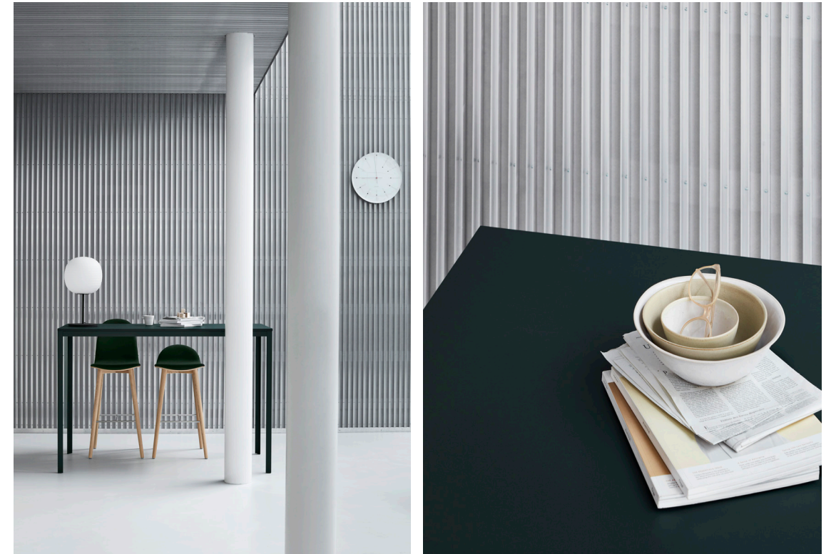
Kant high table Nam Nam wood high and low back bar stool