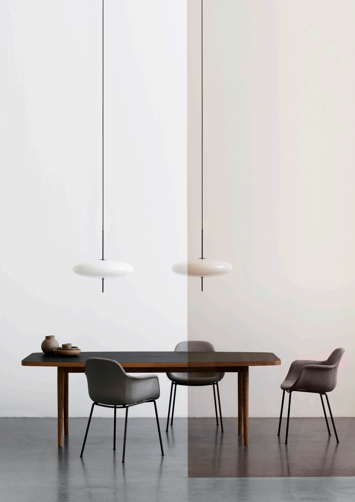
Refined profiles, intuitive functionality and natural materials. There's a luxury found in such simplicity.