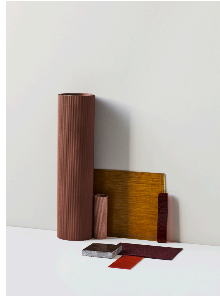
Light and colour, form and tactility are combined to charm and draw the eye.