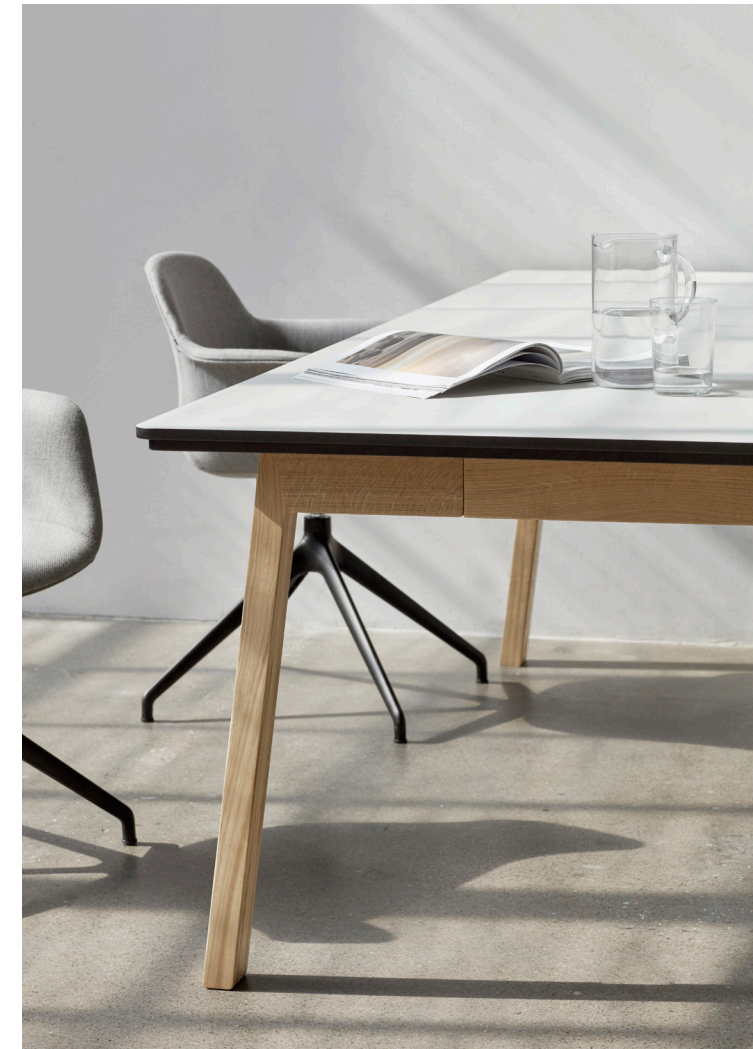
Facit meeting table Arena chair swivel base