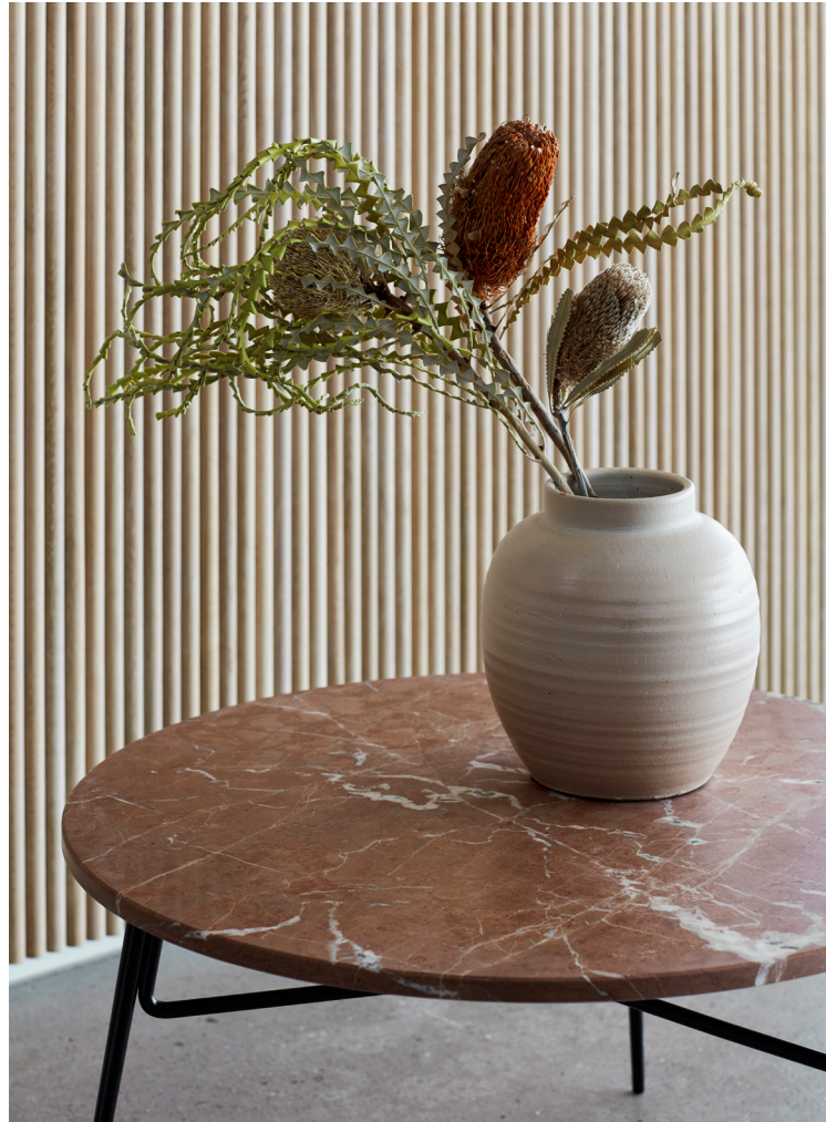
Spire marble coffee table