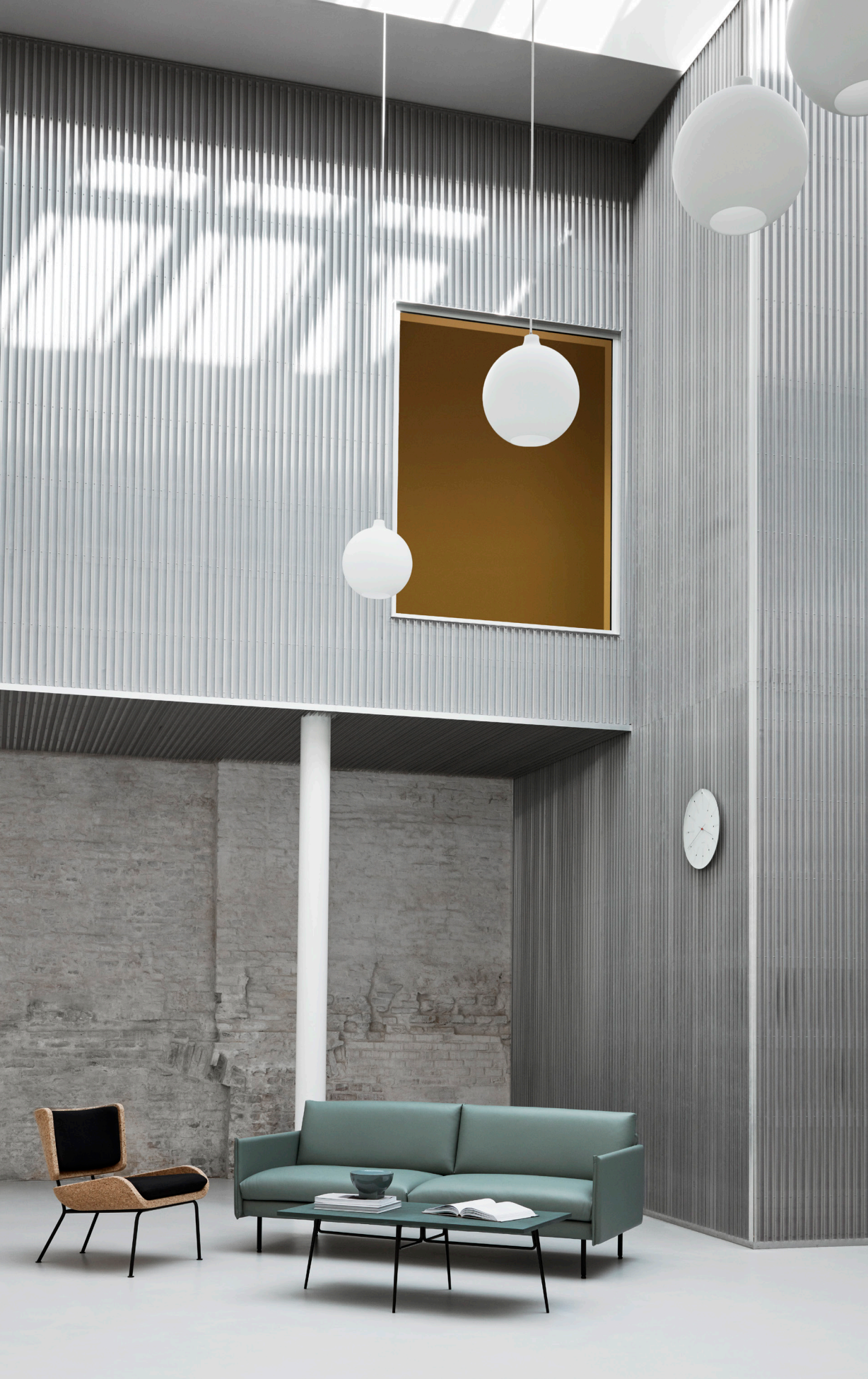
Form sofa Spire slate coffee table / Bark lounge chair