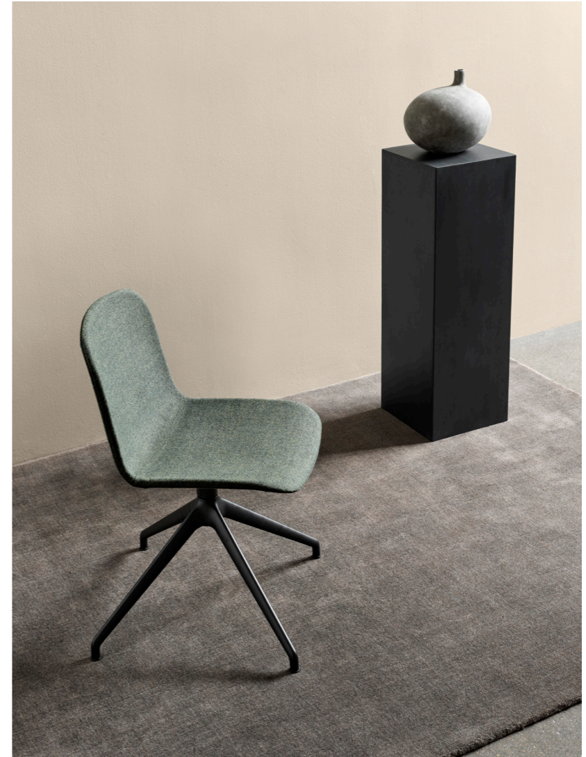
Sky chair 4 star base

Designed by Mia Lagerman, Sky is designed to match your activities in the workplace. Sculpted for comfort with just the right flexibility, the moulded shell provides comfort and supports users for an extended sit. The chair series is versatile and complements the diverse nature of work settings.