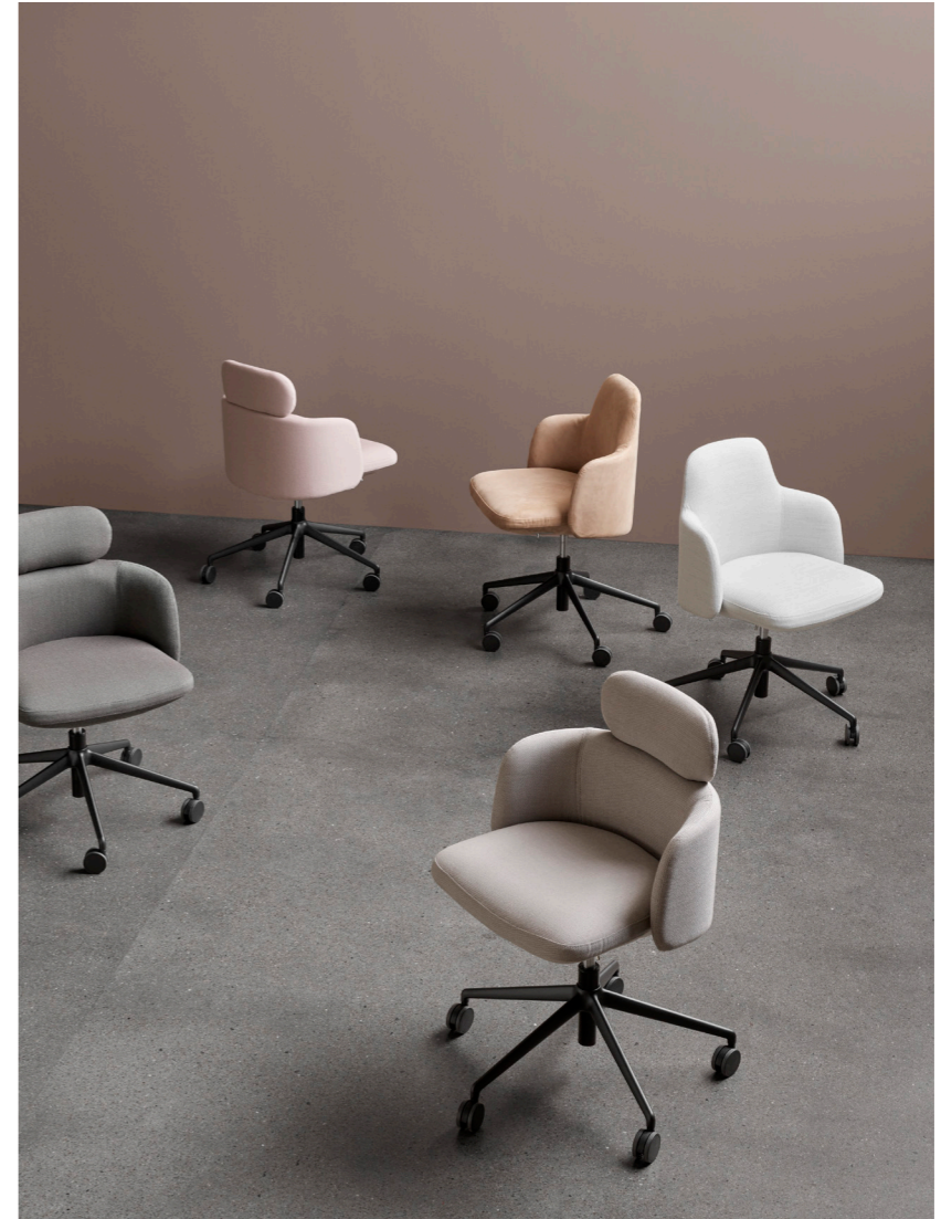
Crossover Young Iconic Crossover Modern Executive

Designed by Hans Thyge & Co, Crossover is a meeting point between two concepts - the ergonomics and functionality of a task chair combined with the sophisticated profile of a meeting chair. The result is an all-day chair that draws the eye and provides comfort for the spectrum of work activities.