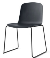
Sky Sled base