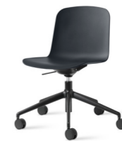
Sky 5 star castor base