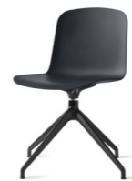
Sky 4 star base