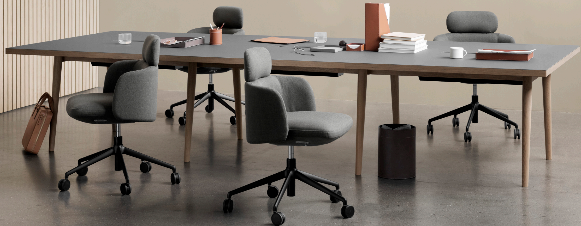
Forum workstation Crossover Young Iconic

The refined design of the Crossover series creates a sense of finesse in the workspace and is perfect for hot-desking, workstation and meeting settings.