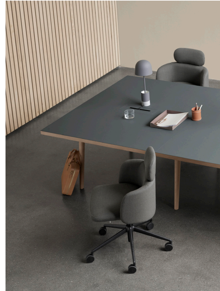
Forum Workstation Crossover Young Iconic