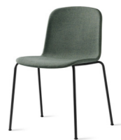
Upholstered 4 leg

For more information visit iconsofdenmark.dk