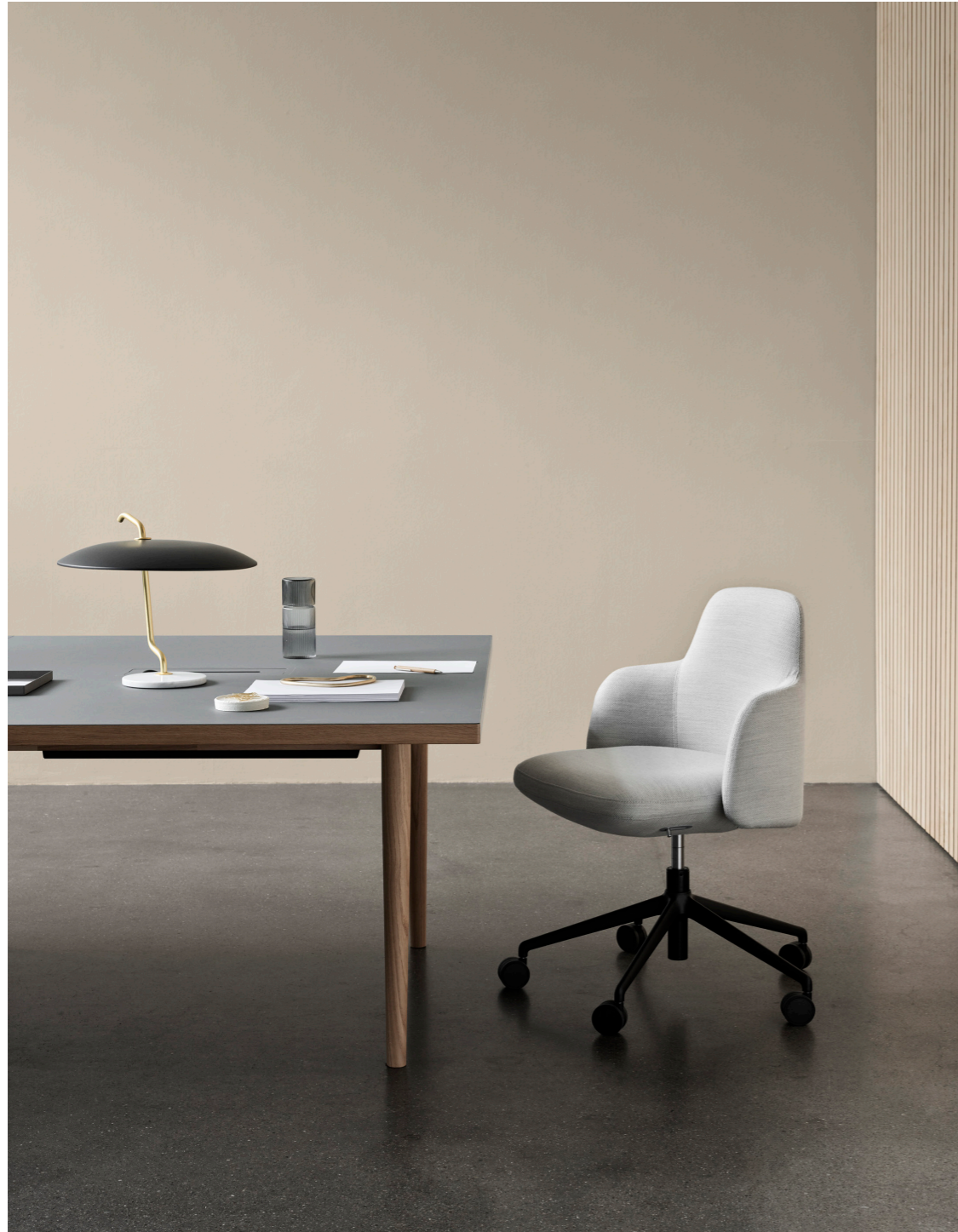
Forum Workstation Crossover Modern Executive