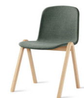
Upholstered Wood leg