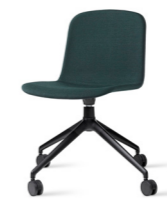
Upholstered 4 star castor base