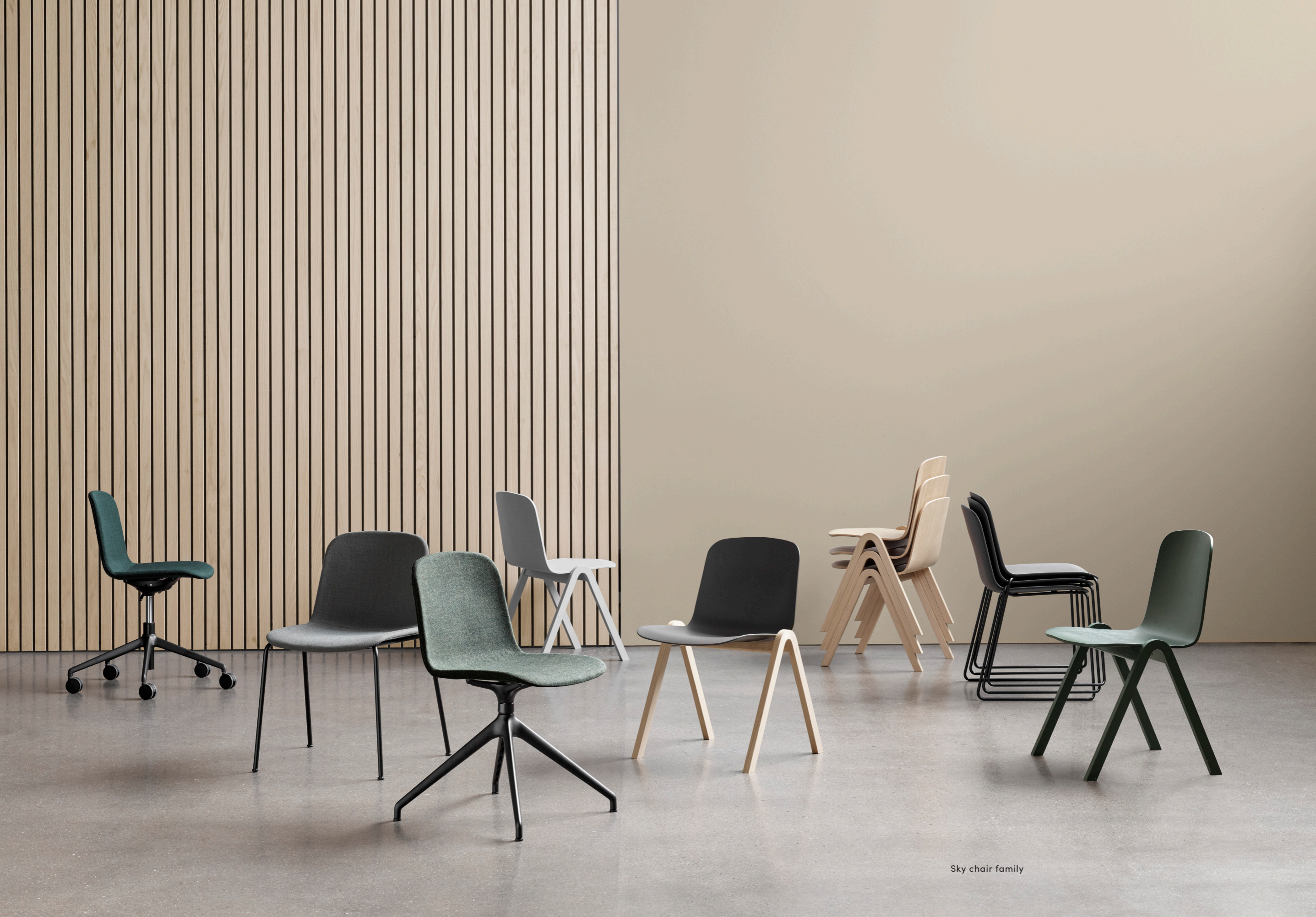
Sky chair family