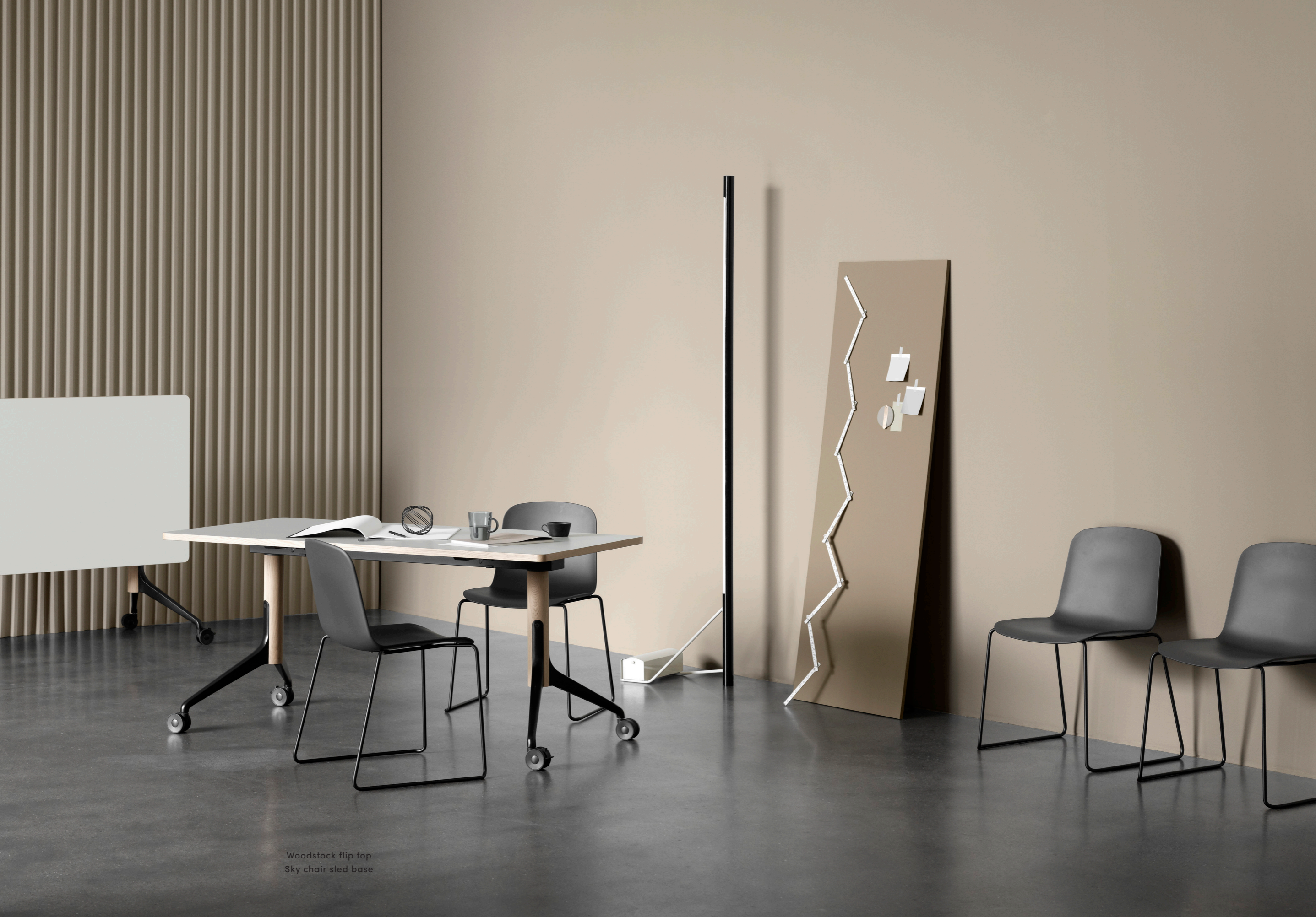
Woodstock flip top Sky chair sled base