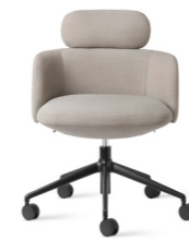
Young Iconic 5 star castor