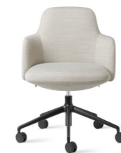
Modern Executive 5 star castor